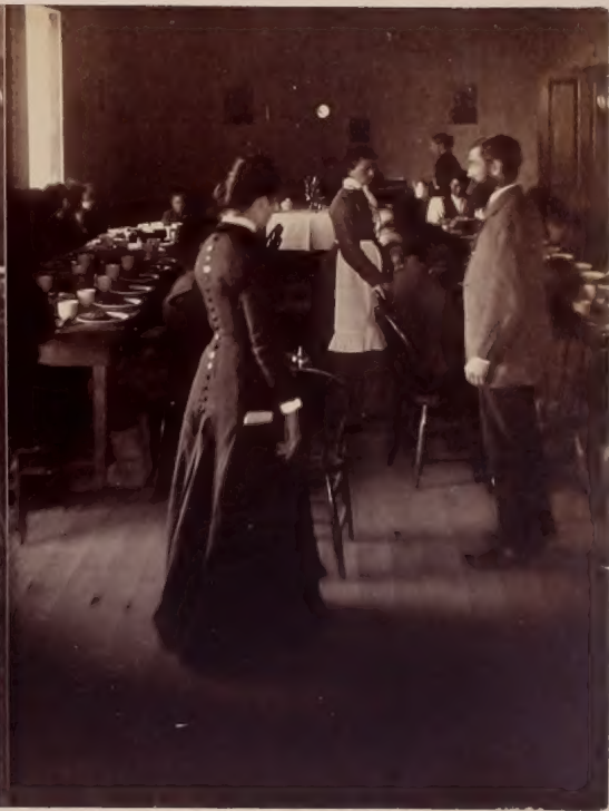
Indian School at Albuquerque, New Mexico.